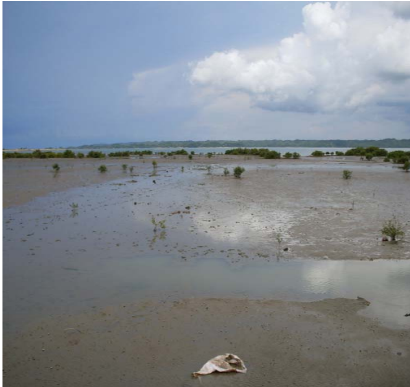
Before ( 2009)